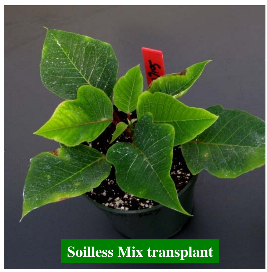
Poinsettia 'Prestige Red', 24-h after transplant